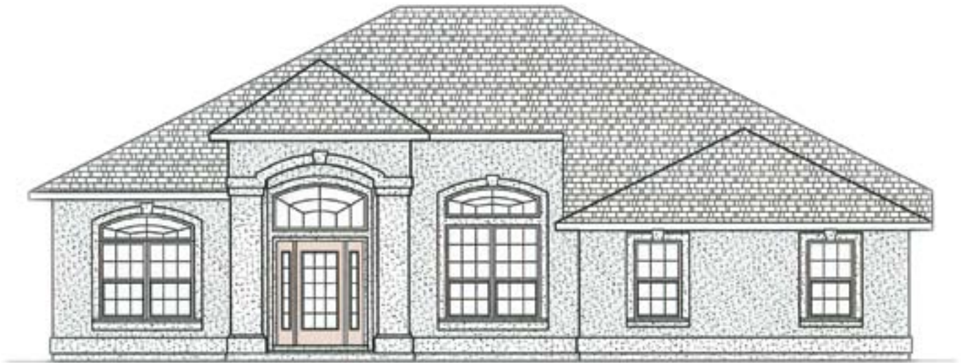
— front elevation —